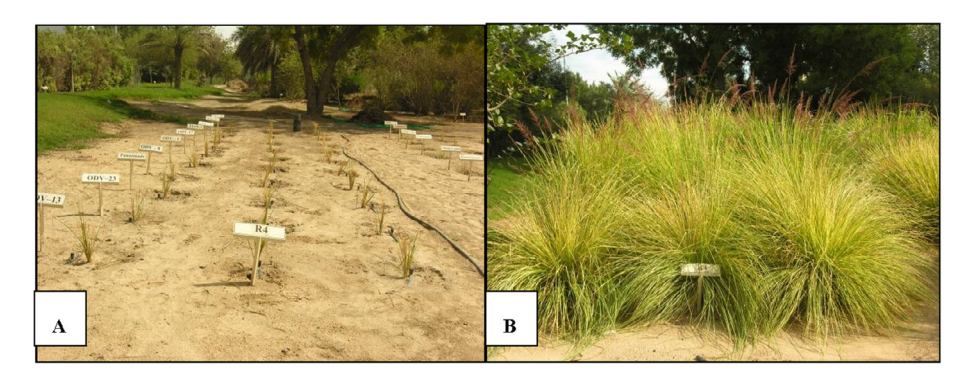
Fig. 1. Vetiver plants during January, 2011 (A) and November, 2011 (B).